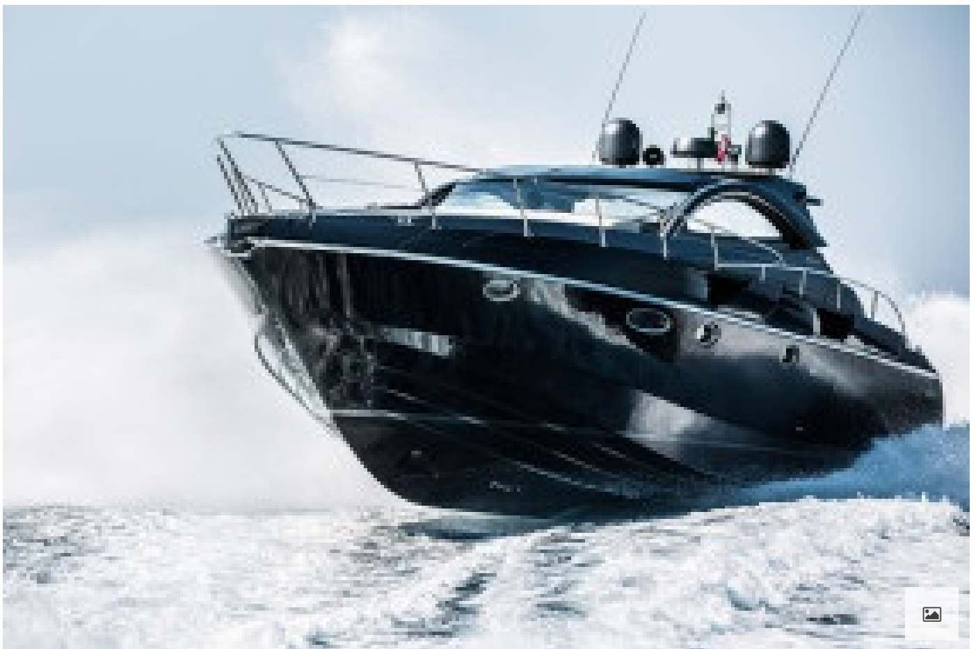
Rizzardi 48IN: mean machine