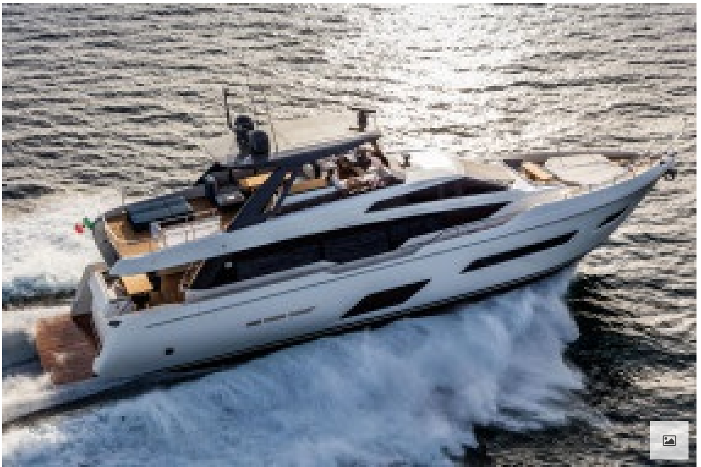
New for 2018: Ferretti Yachts 780 takes over from the successful past