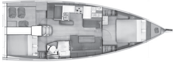
Version A Forward Owner's cabin 1 aft cabin / 1 head

(Dressing + furniture with private sink in forward cabin, in option)