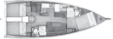
Version D Forward Owner's cabin 2 aft cabins / 2 heads

(Dressing + furniture with private sink in forward cabin, in option)