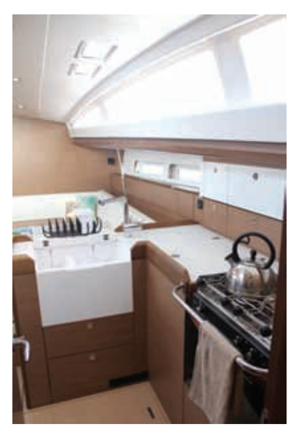
Light and airy galley with sink covers folded up to provide drying rack or serving space.

navigation table. On the test yacht there was a nice little seperate refrigerator installed underneath the nav table.