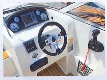
Driving position impressed our tester