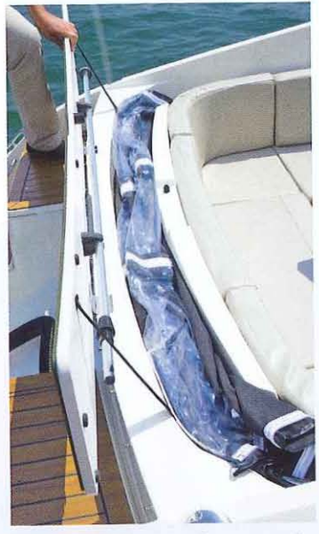
Neat, recessed canopy is easy to use