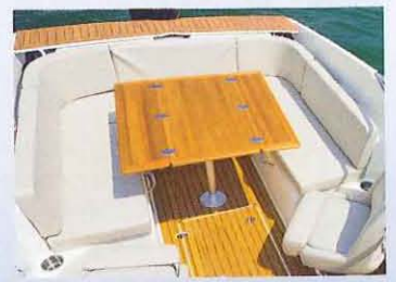
Seating for seven, not bad for 20ft