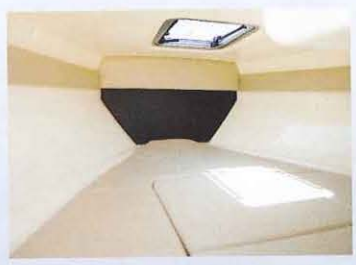
Tight access but good cabin space