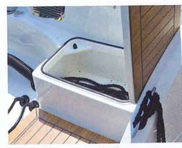
Lined lockers cover the boat