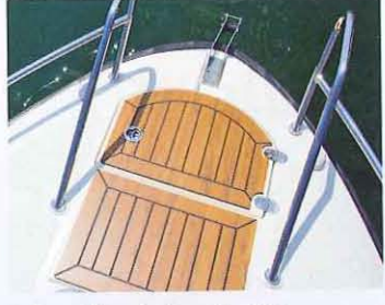
Gripped foredeck and locker