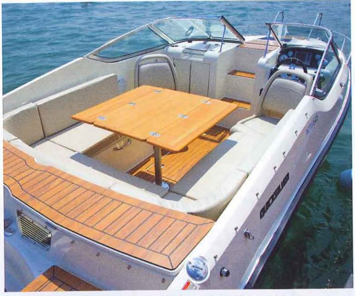
A smart, clean and very practical cockpit makes dayboating a joy