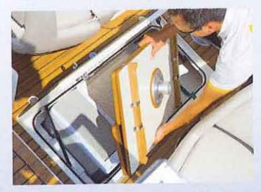
Cockpit table stows when not in use