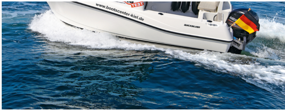
Quicksilver Captur 555 Pilothouse