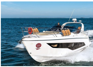
Test: Cranchi Z 35