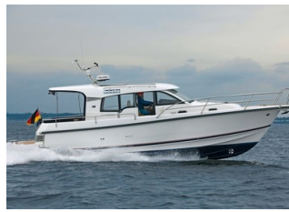
Driving Report: Nimbus 365 Coupé