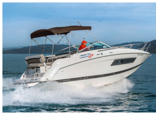
Review: Four Winns Vista 255