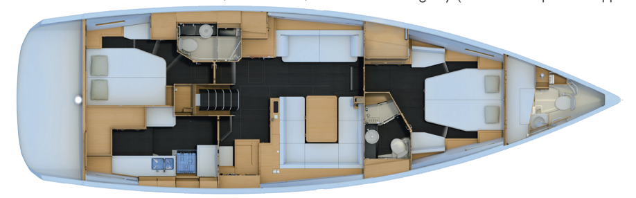
3 cabin version : Forward owner's cabin, VIP aft cabin, aft guest cabin

2 cabin version : Forward owner's cabin, VIP aft cabin, full saloon and aft galley (shown with optional skipper cabin)