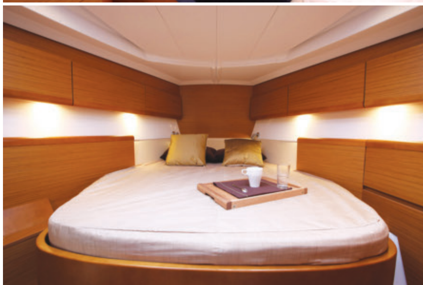
The aft cabins, top, are comfortable for one or two and make excellent sea berths. The owner's version forward cabin can be designed with an island berth, above, or a large v-berth

and rail on the amidships seat at the dinette. The cook can lean against and hang on to it while the boat heels. Also, rails in front of the stove and along the counter front provide secure hand holds and protection from the stove.