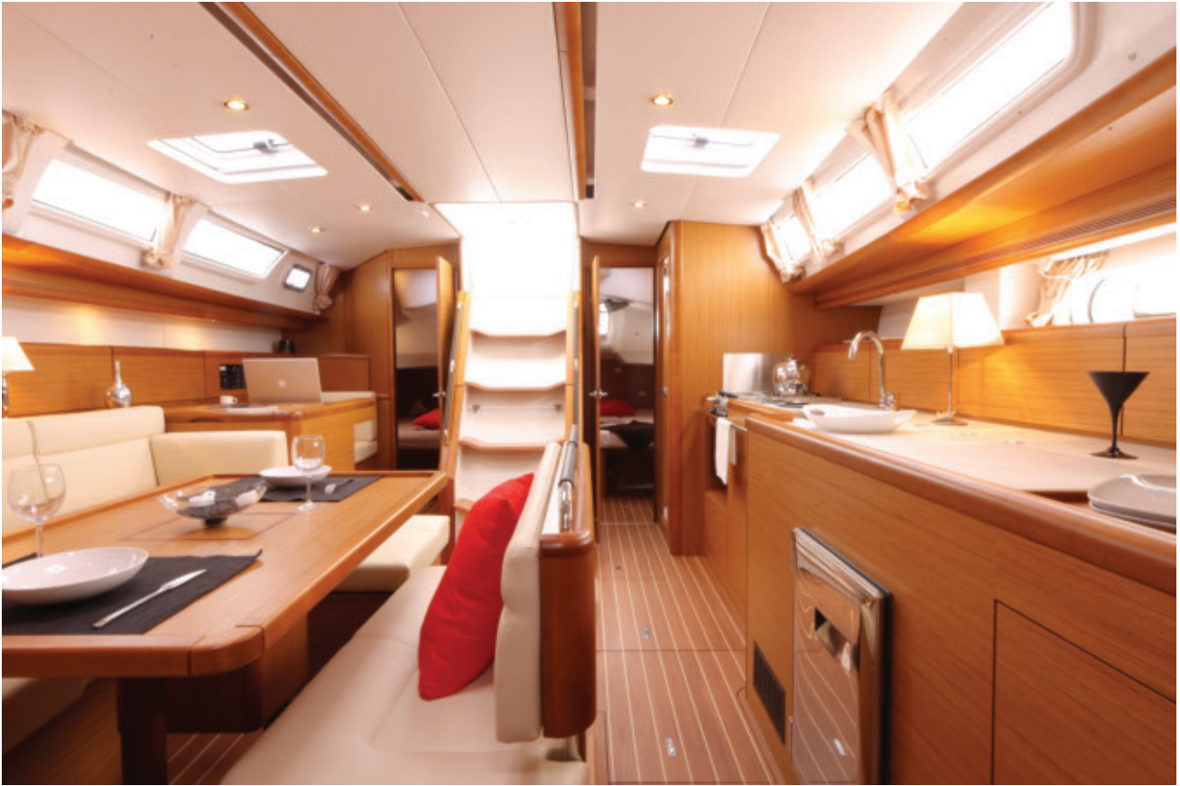
The bright and spacious interior is perfect for a charter or as a floating home. The charter version has four cabins, two fore and two aft, while the owner's version converts the forward cabins into a large master cabin

with it sloshing into lockers and the bilge pump removed it in about five seconds.