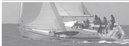
Sun Odyssey 45 DS