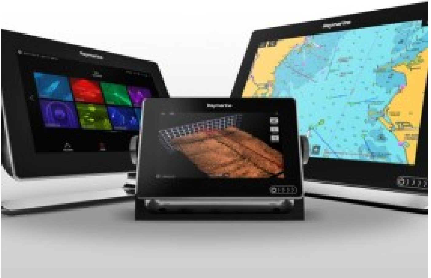
The new Raymarine Axiom Multifunction Displays on test. What can('t) they do?