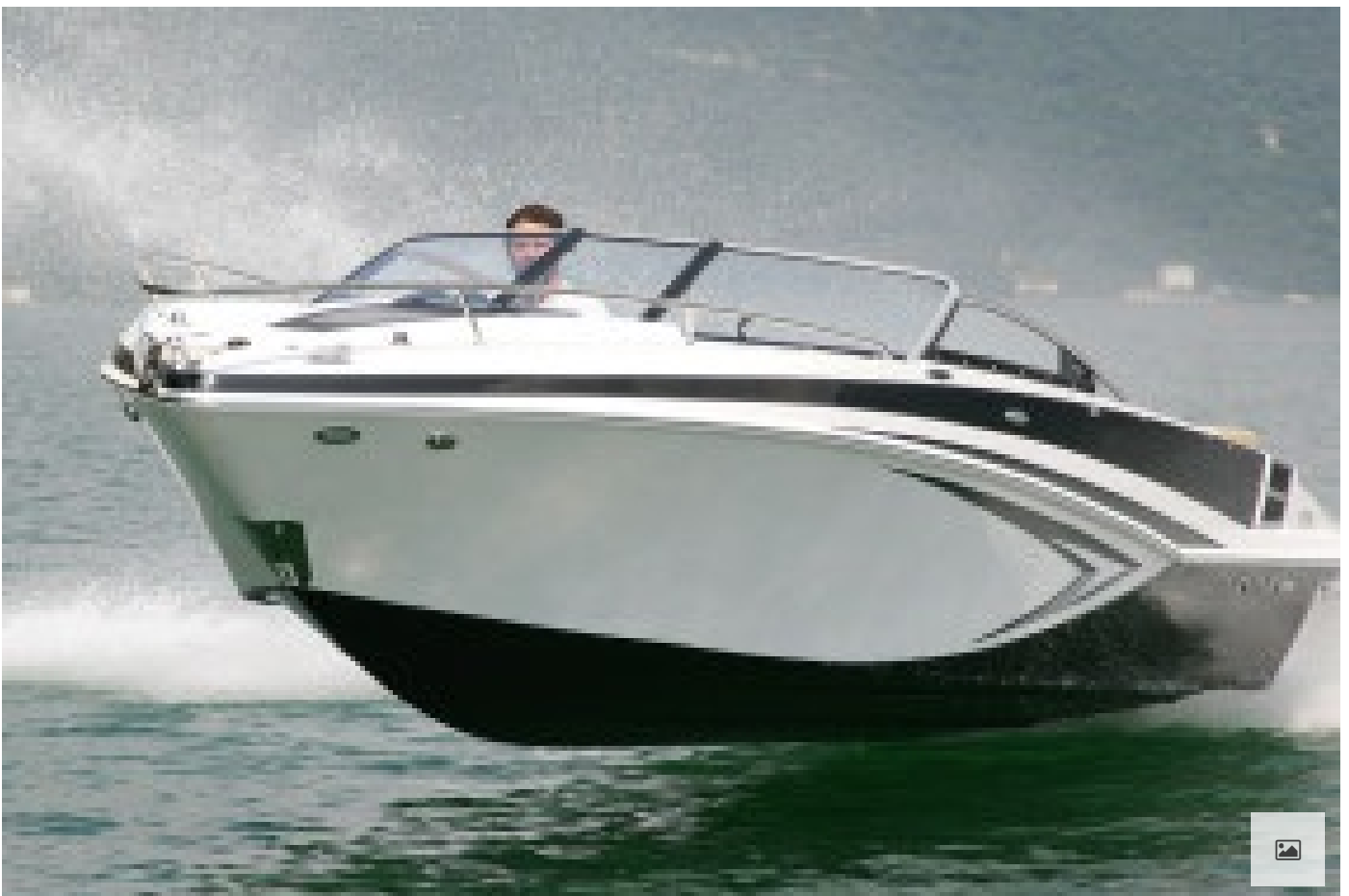
Glastron GT 229: Yankee style, Swedish heart and French passport