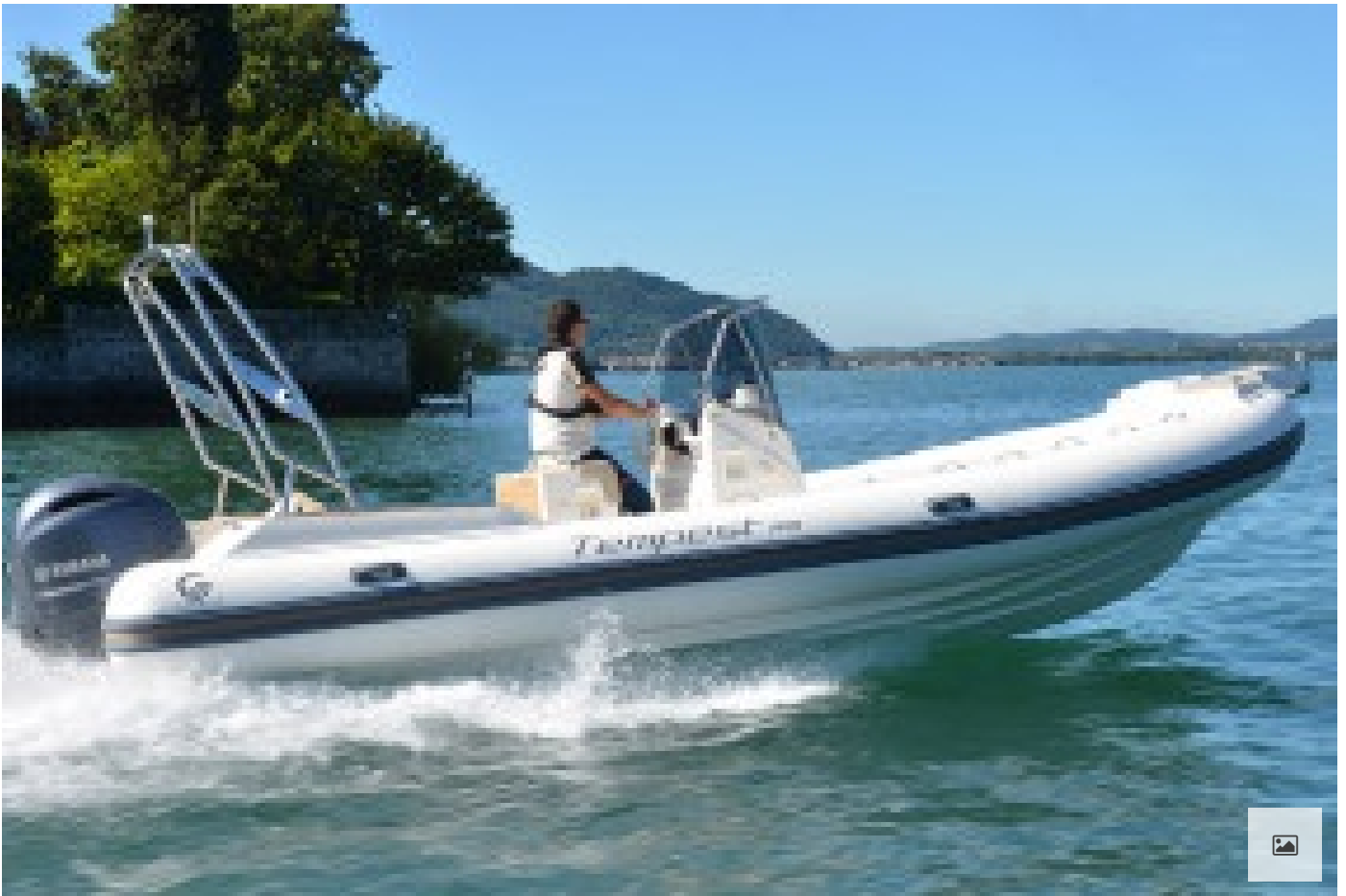
Capelli Tempest 700 e Yamaha F175C: the perfect match