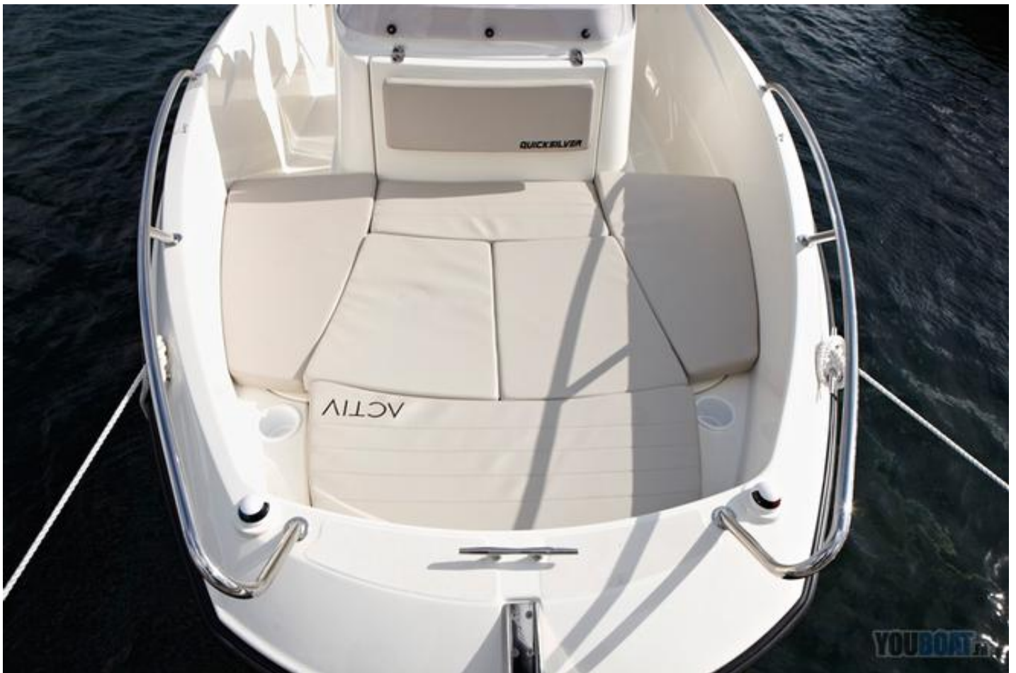
Quicksilver Activ 505 Open spacious

runabout through family dayboat to a serious angling platform, or as a tender for a large power yacht.