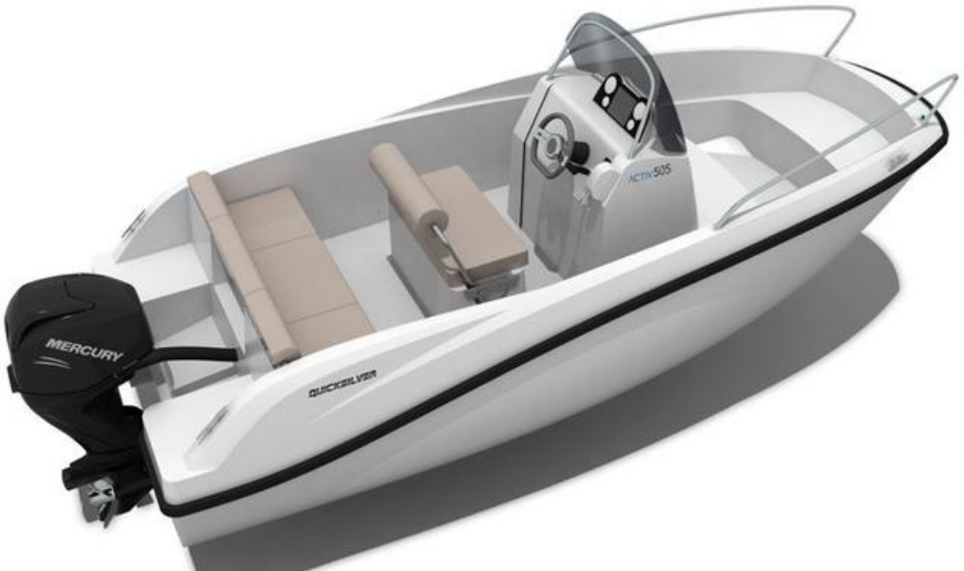
Quicksilver Activ 505 Open render

The centre-console makes an ideal helm station and its interior provides enormous storage. The double seat accommodates skippers who wish to drive either seated or standing. The other lounges range from a more protected and relaxed style across the back of the 505 or there is added excitement and a 'breath of fresh sea air' available in front of the console as well as right forward across the wide bow area.