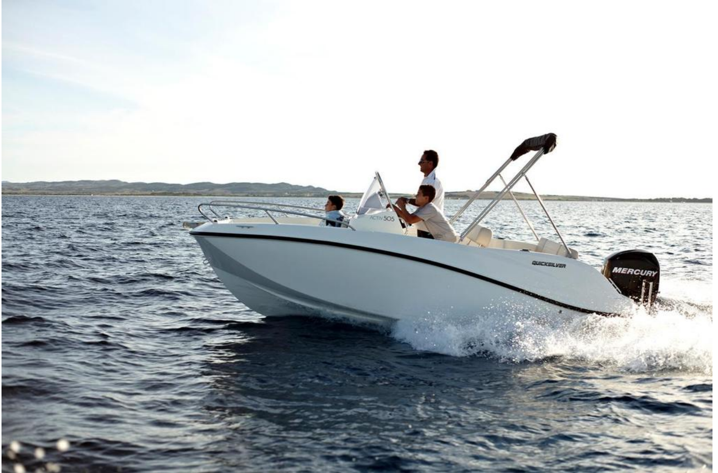
Quicksilver Activ 505 Open Collins Marine