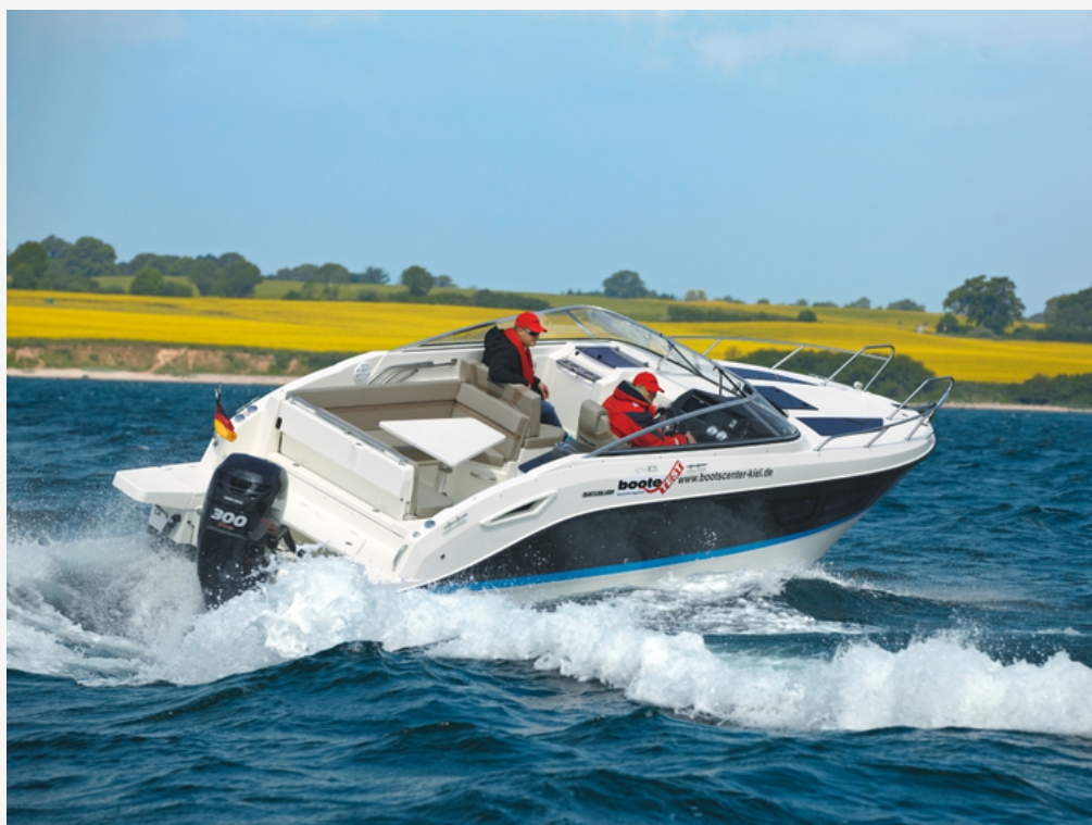
Test: Quicksilver Activ 805 Cruiser - Mercurys Verado 300 Plus, the skipper is always in control thanks to the electrohydraulic steering system