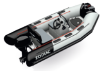
OPEN 3.1 1