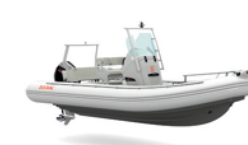
OPEN 6.5 2