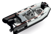
OPEN 3.4 1