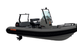
OPEN 5.5 2